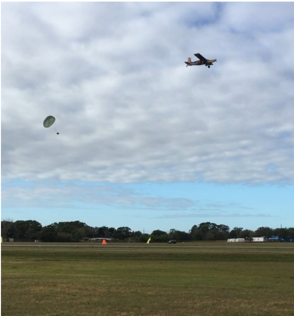
Low altitude package drop practice going on at Dunn Airpark. Wonder what they're dropping??

Arthur Dunn Airpark has been busier this January than it has been for quite a while. The exception was Jan.7 the day of our chapter breakfast. Bands of showers crossed the airport and the pancakes were special because they were sprinkled with fresh raindrops! No complaints though! Bob, Deborah and I were out there in the rain doing our cooking. No big deal cause we've been wet before!